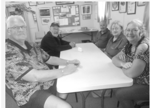
4 members from the Bendigo Morris Club

We all had a very pleasant weekend with no major breakdowns, although there were a couple of times where the bonnet was up for checking.