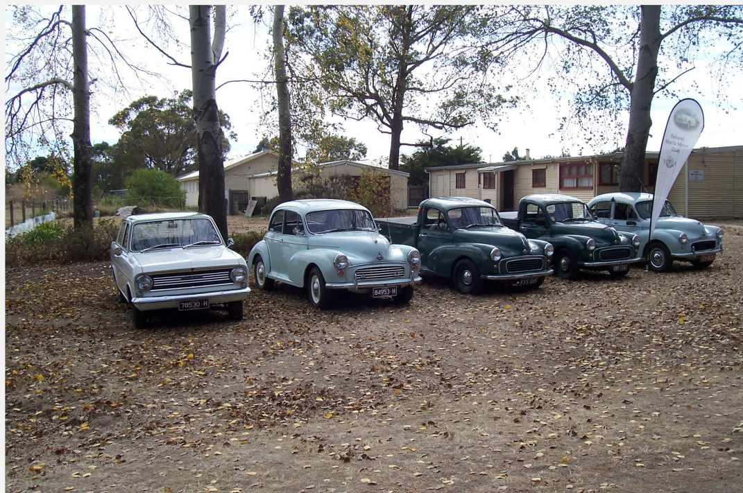
Some of the cars at our BMMC Invitation Weekend